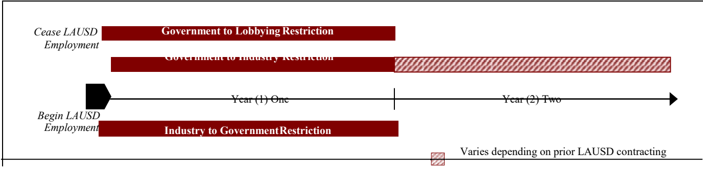
Figure 2 – Schematic of LAUSD Cooling Periods (Illustrative Only)

(1) Government to Lobbying Restriction (One-Year Cooling Period) – LAUSD will not contract with any entity that compensates a former LAUSD official who lobbies LAUSD before a one (1) year period has elapsed from that official's last date of employment